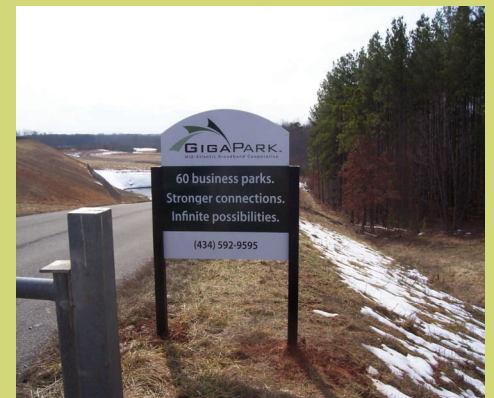
Airport Industrial Park, Mecklenburg County