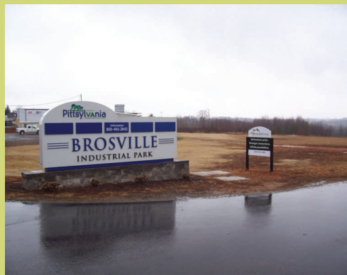
Brosville Industrial Park, Pittsylvania County