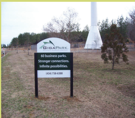
Seneca Commerce Park, Campbell County

If you want to know more about GigaParks, visit the website at www.gigapark-va.com .